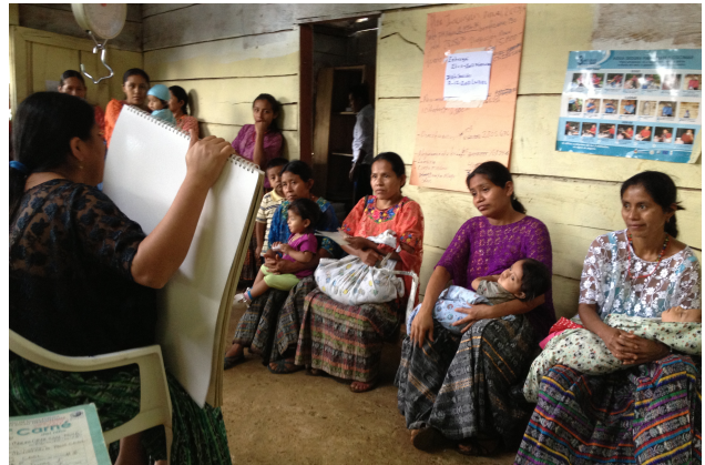
Guatemalan mothers attend a Behavior Change Communication session

The above examples provided program teams with a deeper understanding of some of the most interesting and influential determinants and people that impact the ability of the beneficiary population to adopt recommended behaviors. The next step in the process is translating this evidence into strategic and programmatic change that will maximize the impact of the motivators and minimize the impact of the barriers faced by our beneficiaries. Sometimes these changes can come about easily, as in the case of Guatemala's PROCOMIDA program. To help mothers remember to initiate complementary feeding when their babies turned six months old, health outreach workers simply needed to consult their carnets (official documents maintained by the program to track infant growth progress) before each monthly food distribution and education session. They would then take a minute before each session with the mothers in each community to "celebrate" the babies who were turning six months that month, and remind the group that it was the appropriate time to begin introducing complementary foods. This is an example of a pragmatic solution to one of the most significant barriers identified in the formative research to timely adoption of complementary feeding, one that came at no cost to the program and required minimal effort on behalf of the community health workers.