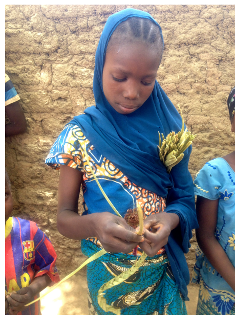
A young girl weaves palm fronds for her mother in Maradi, Niger