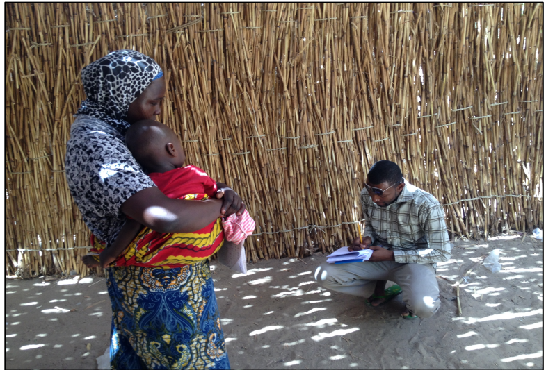
An interview with a beneficiary mother in Maradi, Niger

Mercy Corps believes that even in the world’s most challenging places, people have the power to transform their own lives when they have the right resources. To leverage their local knowledge and develop innovative and sustainable solutions, it is essential that those delivering programs have a comprehensive understanding of their beneficiaries’ perceptions, including the underlying motivators and barriers they face in practicing behaviors that improve their lives. The best way to accomplish this is to talk to them and include them in the conversation. Barrier Analysis provides a guide to this conversation that ensures a solid understanding of why people make the choices they do about their behaviors. Through this responsible, participatory formative research, implementers are able to design more efficient, more effective, and more sustainable programs that ultimately improve quality of life in some of the most vulnerable communities in the world.